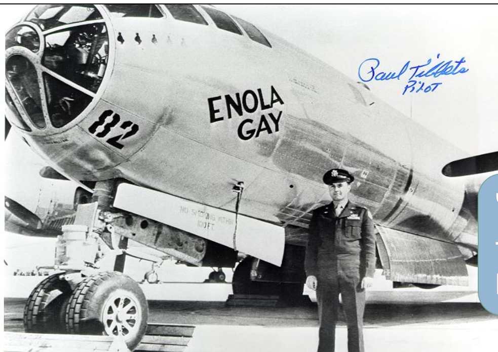
"Little Boy" in the pit ready for loading into the bomb bay of Enola Gay.