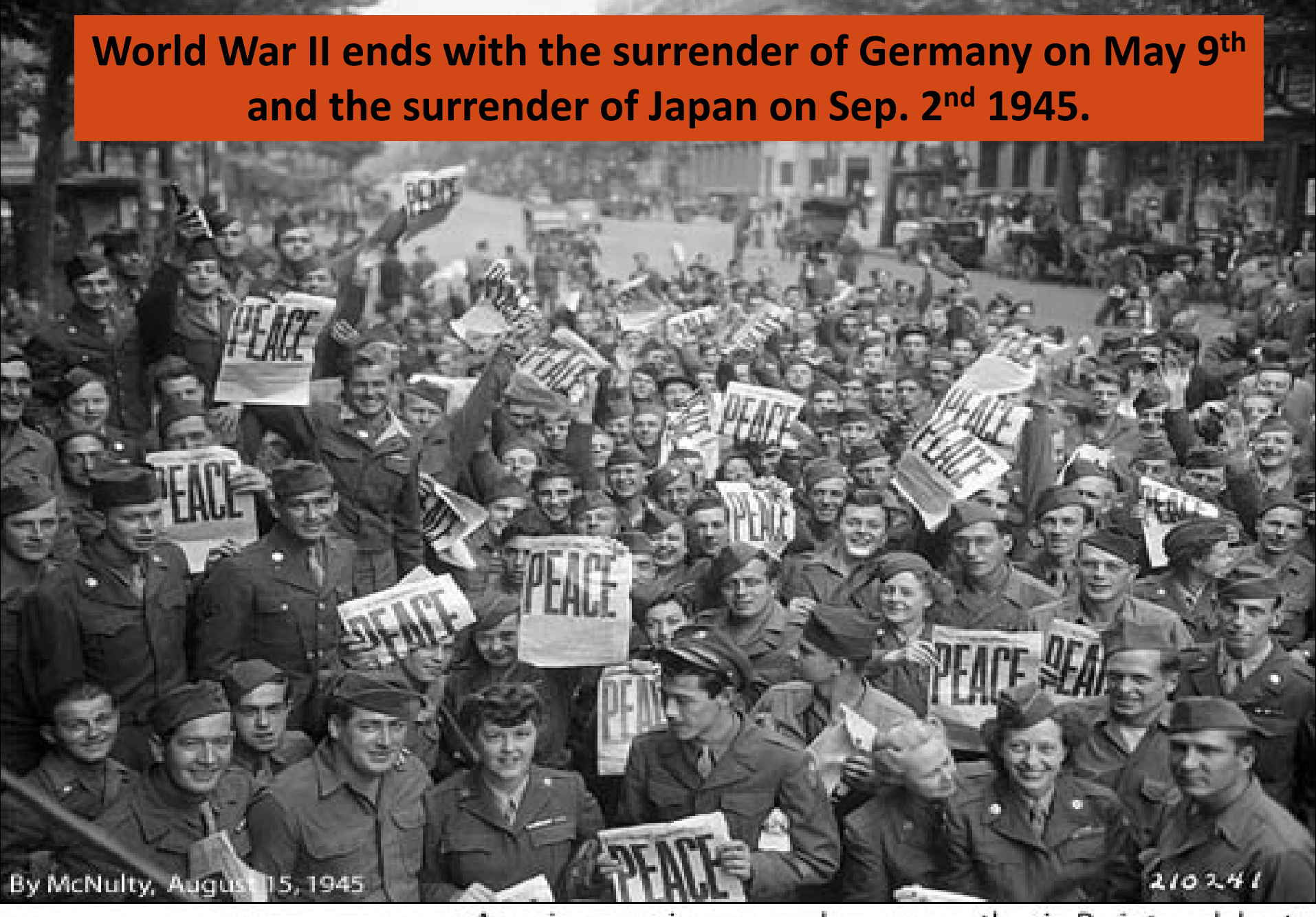
American servicemen and women gather in Paris to celebrate the unconditional surrender of the Japanese.